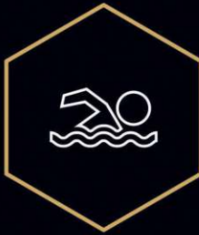
Pools & Water Bodies